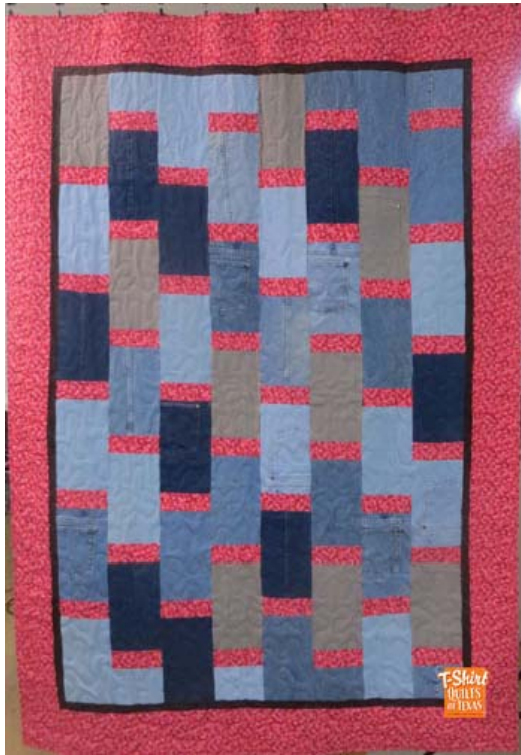
Bricks & Mortar style quilt. The 'bricks' are jean material, the 'mortar' is a red Texas flower print.

Well, first of all, we hang on to them for awhile, because once your family members have seen the quilts YOU had made, they may decide they want one. No problem, we just make more.