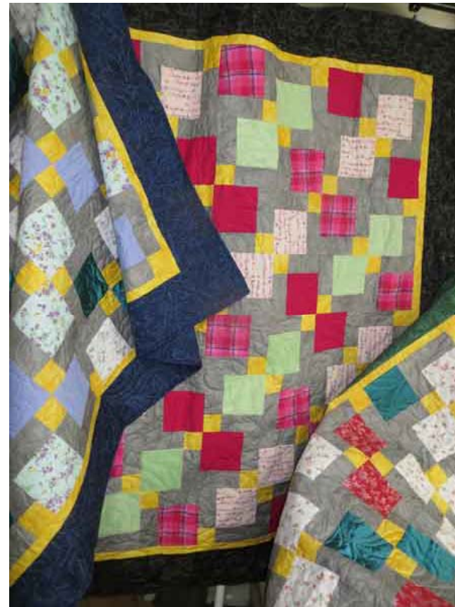
Set of 3 quilts made from nightgowns and blouses.

You can use just about any material in your quilt. Just note that if an item is "dry-clean only", the quilt you put it into also becomes "dry-clean only."