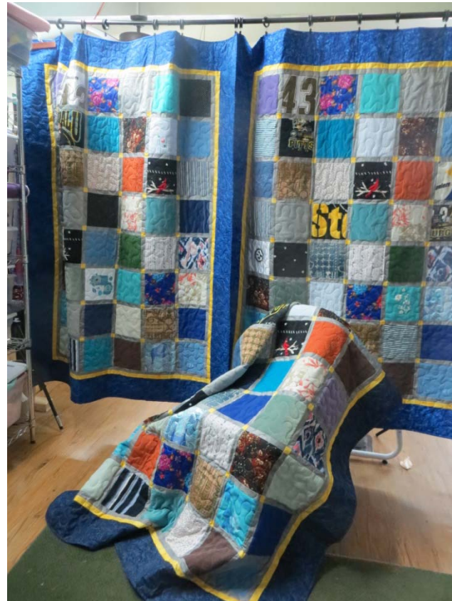
Set of 3 quilts made from polo shirts, shirts and jeans. Traditional style quilt