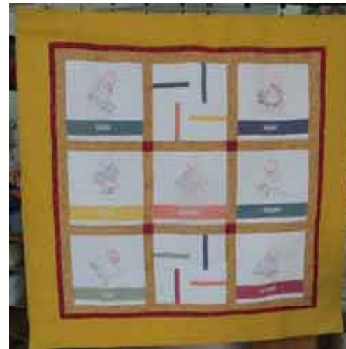
Quilt made with 7 linen towels