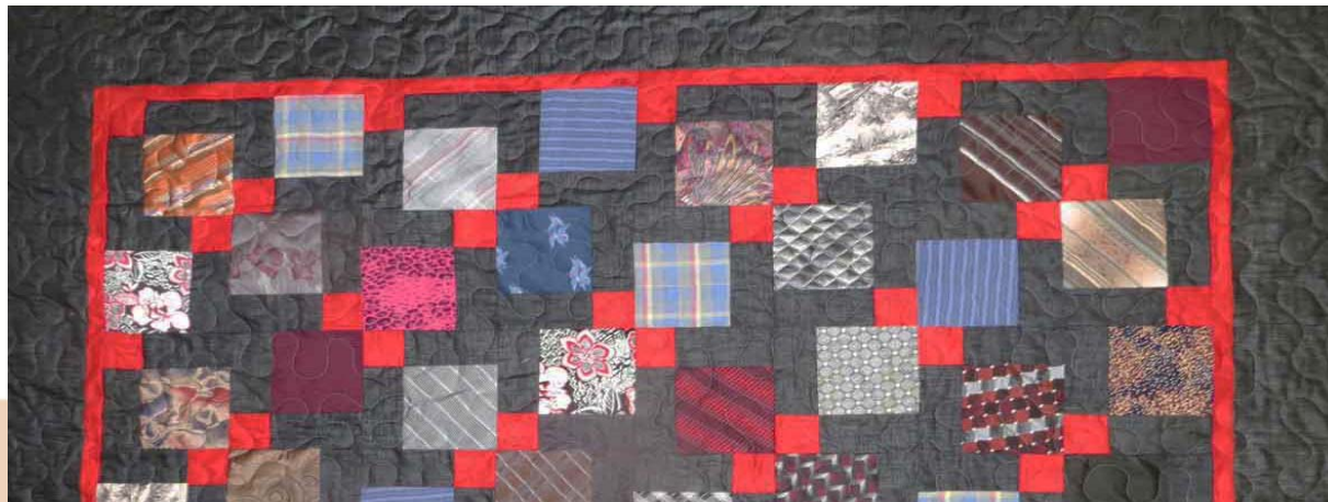
Memory Quilt Made from Ties