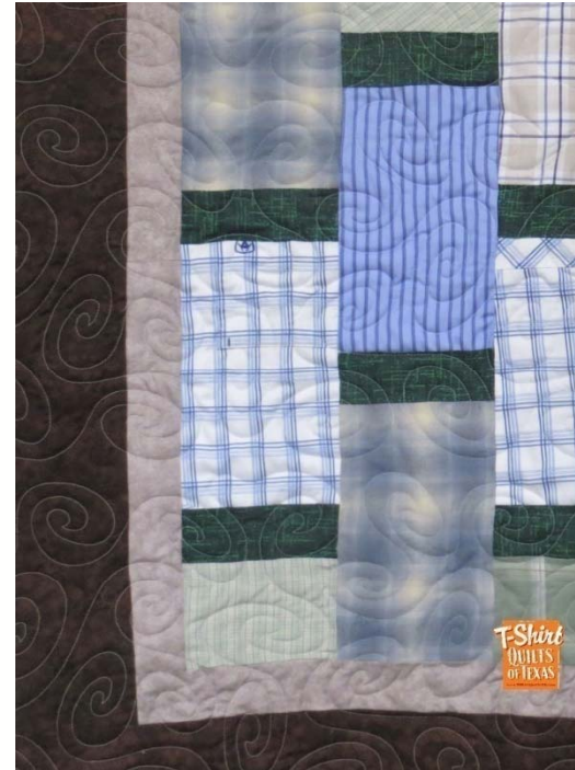
Dress shirts made into a Bricks and Mortar Style Memory Quilt.

For items that you want to assign to a specific quilt or more than one (but, not all), using painters tape, list which number or name(s) that should get a piece from that item.